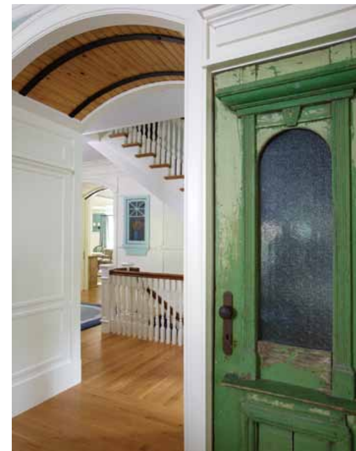
The kitchen and family room (left) showcase salvaged pieces that lend flair and originality to the home. A barn door from New England (left) slides open and closed on its original track, and a pair of green entry doors found in a Paris Flea Market conceals closets. An arched passageway leading to the hall (above) is lined with wood to pick up the warm hues of the wide-plank floors.

T he farmhouse was a holdover from early in the last century, haphazardly altered over many years by eight different owners to fit the needs of their families. Countless changes to the original 1907 house had taken place, and along the way an open-plan wing had been added for space and contrast. Located on an acre and a quarter in the Village of St. Martin's Additions in Chevy Chase, the old house was a stalwart survivor, even as real estate development extended beyond DC to surround it. However, in the 21st century, the dwelling entered its final metamorphosis when a couple who moved there in 1999 to start their own family finally decided to dismantle it and build something new.