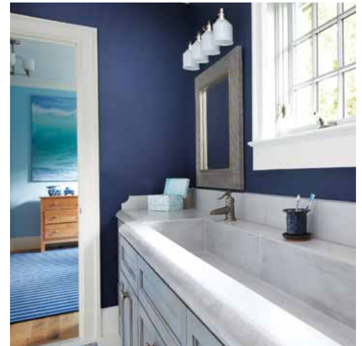
A window seat (opposite) with a semi-circular window and built-ins occupies the upstairs landing. The roomy master bath (top) boasts twin custom-built vanities topped with marble counters and medicine cabinets made from old window frames. The sons' bedrooms flank a bathroom (above) with a trough sink made of poured concrete.