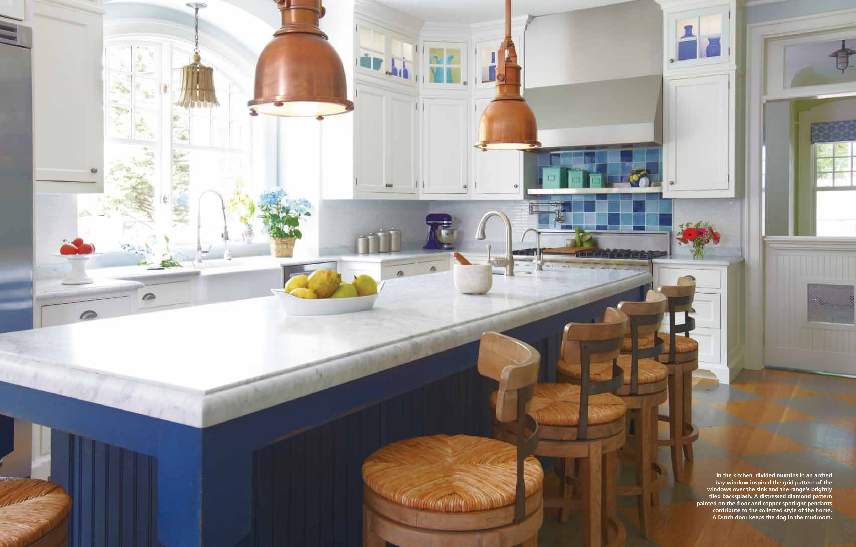
In the kitchen, divided muntins in an arched bay window inspired the grid pattern of the windows over the sink and the range's brightly tiled backsplash. A distressed diamond pattern painted on the floor and copper spotlight pendants contribute to the collected style of the home. A Dutch door keeps the dog in the mudroom.